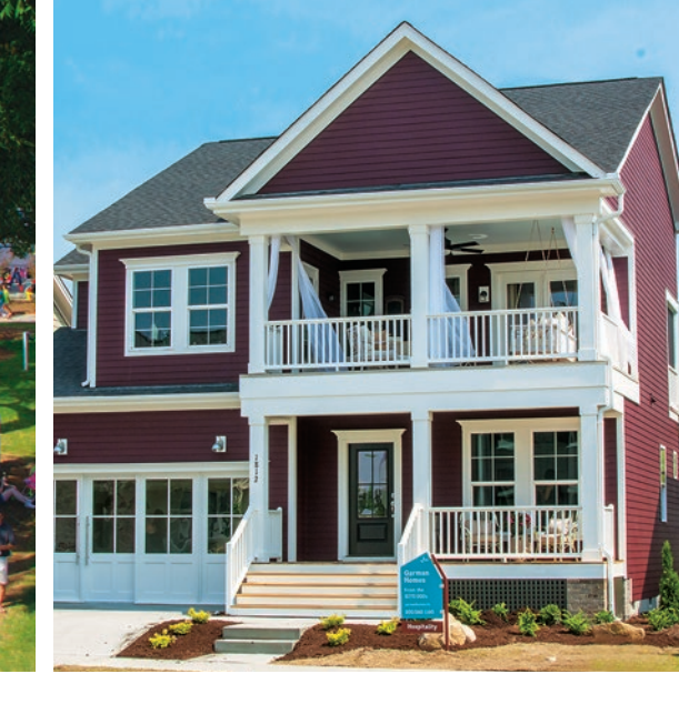
Wendell Falls is an 1,100+ acre mixed use development just minutes from downtown Raleigh.