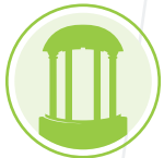
UNC Chapel Hill