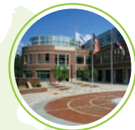
RALEIGH North Carolina