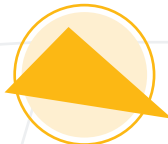
Research Triangle Park