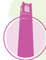
NC State University